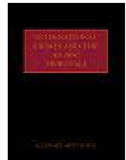
Table of contents - click here