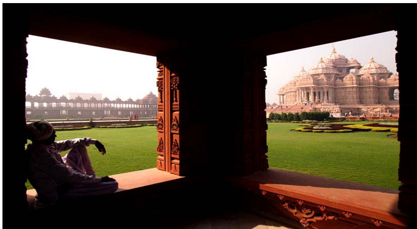
Akshardham Complex, New Delhi